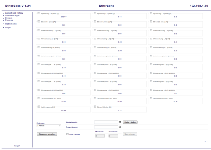
The view of the start page can vary by different device types or versions. The picture above shows the start page of a EtherSens Energy device.

Now the web-server of the EtherSens-device/ MONI should show up with the following start-screen: